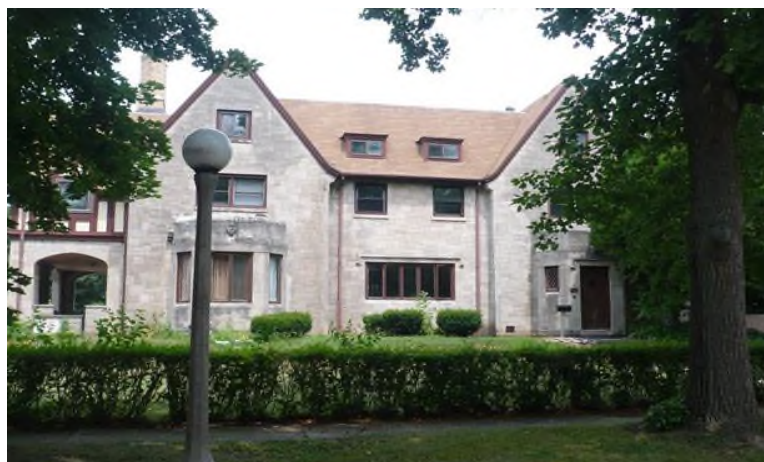
The new Lodge at 606 West Ohio Street in Urbana was built in 1935 for Theta Upsilon sorority. It was owned and occupied by the Alpha Chi Sigma professional chemistry fraternity from 1937 to 2007 before being sold to and renovated by a local property management company.