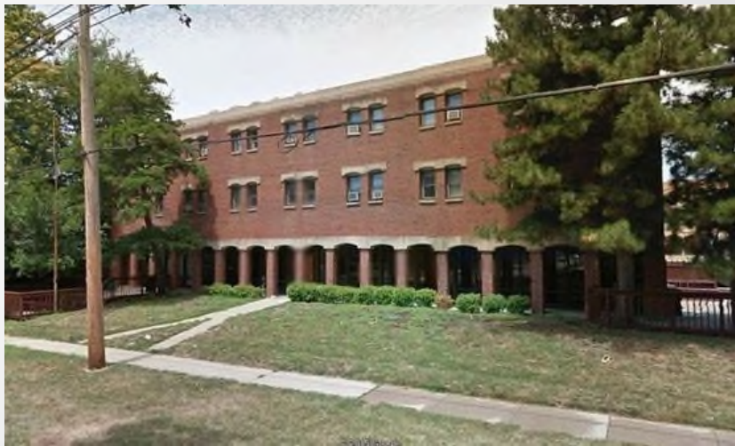
The Lodge at 110 East Armory Avenue was recently sold to Kappa Delta sorority. It will be demolished and a new sorority house will be built in its place.

I'd like to start by saying thank you to all of the actives and alumni who made the trip down to 110 East Armory last May to help with the move to our new lodge at 606 West Ohio. As we were loading up the truck I couldn't help but think of the countless hours we had spent in that building, the brotherhood that was built, and the lifelong friendships that building helped create. It was where I met my girlfriend of 6 years, gained social skills that would help me in my career, and was a place I could always return to and be welcomed back by family. I thought of the hours we had spent making the building a better place to live, the time spent planning the 2012 Convention, and the 4 years I was able to live with my brothers. It was hard for us to pack our belongings and take them