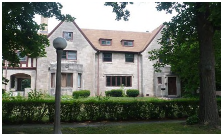
The new Lodge at 606 West Ohio Street in Urbana was built in 1935 for Theta Upsilon sorority. It was owned and occupied by the Alpha Chi Sigma professional chemistry fraternity from 1937 to 2007 before being sold to and renovated by a local property management company.